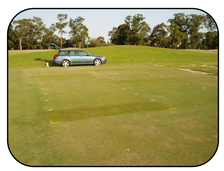
The trial site is shown above after the application on February 12<sup>th</sup> 2008